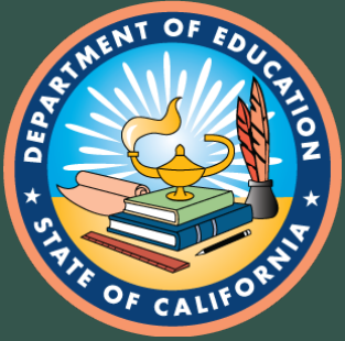
TONY THURMOND State Superintendent of Public Instruction